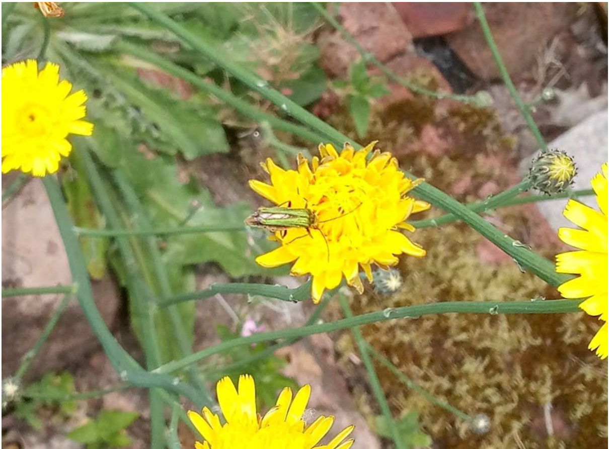
Odemera (thick legged) beetle on hawk weed in garden