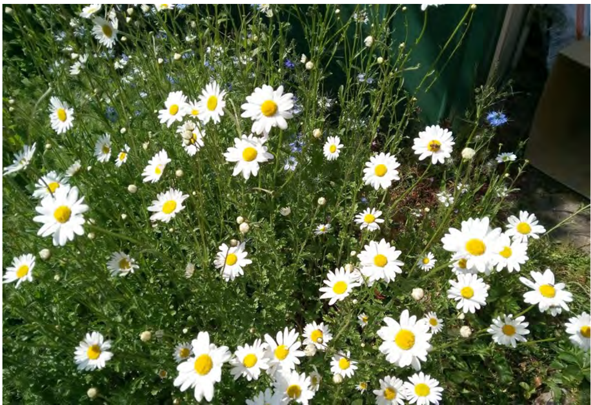
Ox-eye daisy and love-in-a-mist with a bee top right of picture