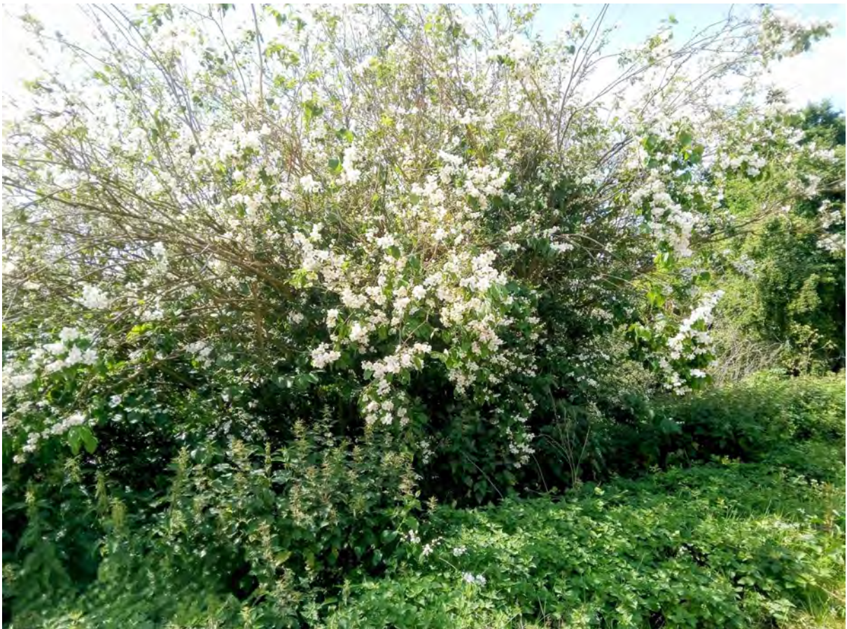
Mock orange ( Philadelphus coronaris ) growing ... Tame Valley Canal overlooking the stadium