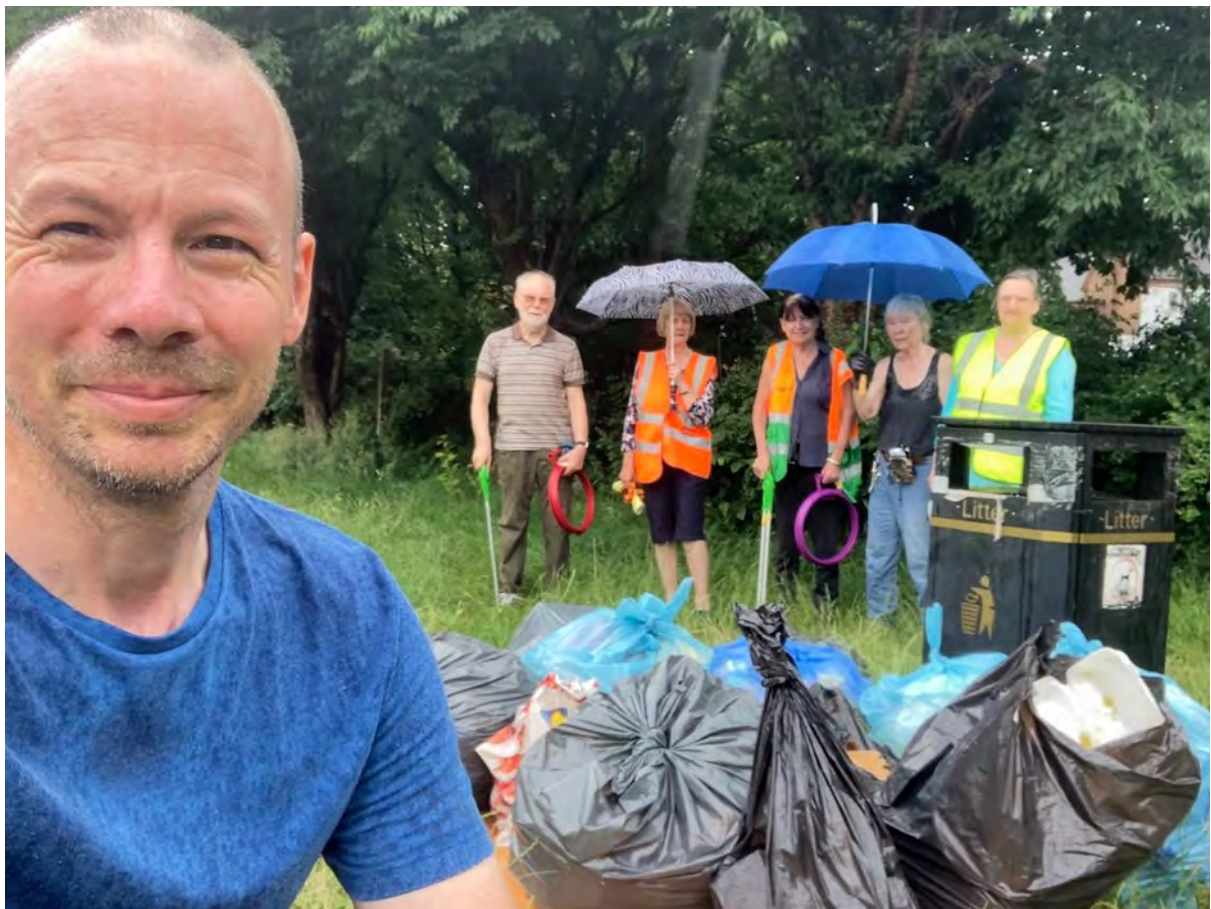
FOPPs litter picking group with the 12 bags of rubbish collected just as the rain came down.