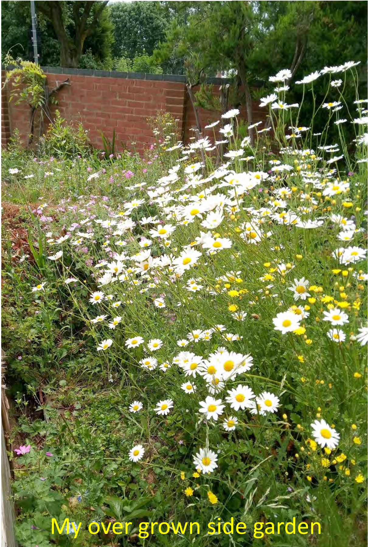
My over grown side garden