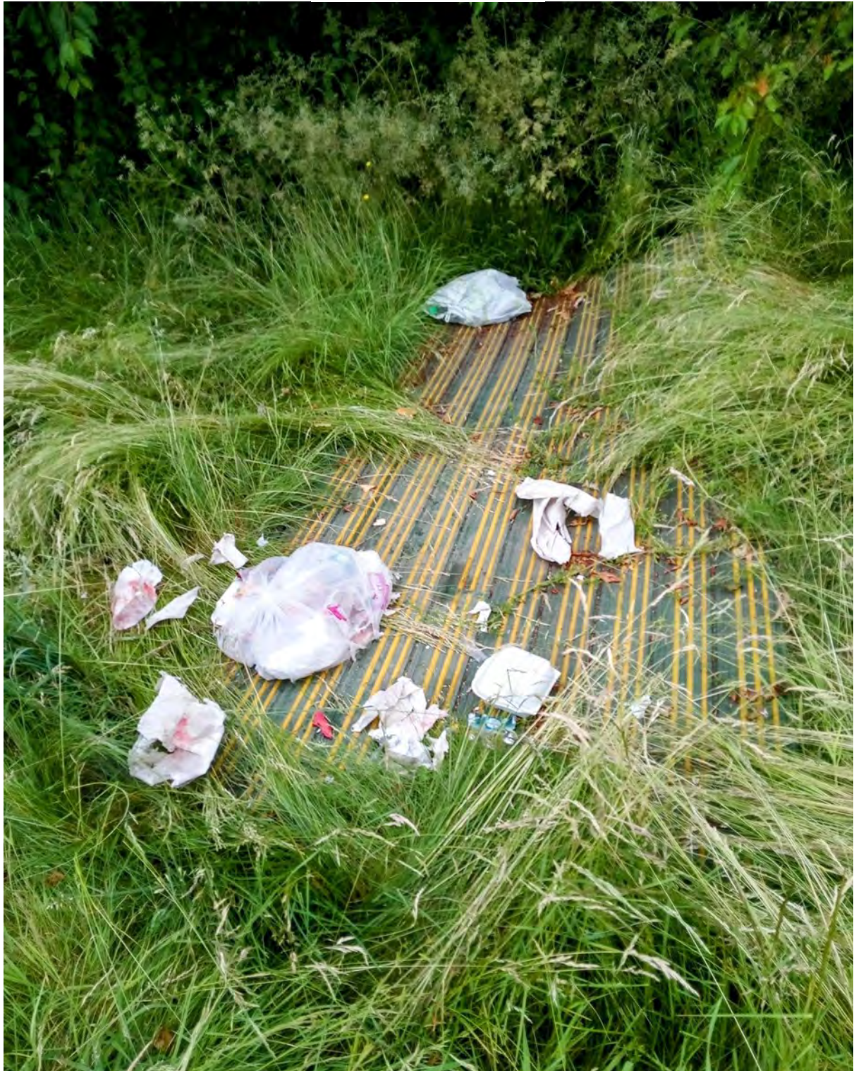
A bit of the litter collected on 19th June